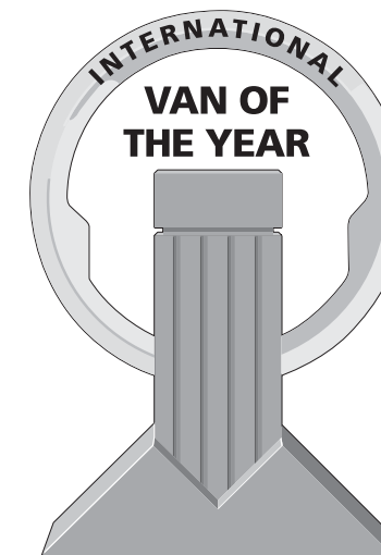
Based on European produced and sold model